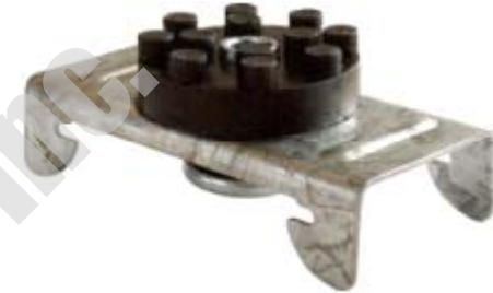
FCS 101-CJ Steel Joist