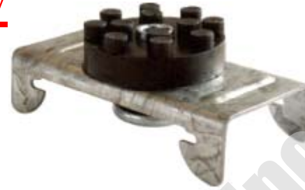
FCS 14-MLG Steel Joist